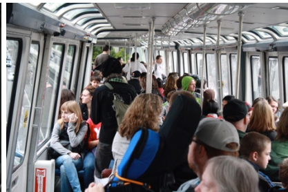
Train in use