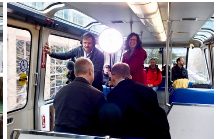
Lights, camera, action!